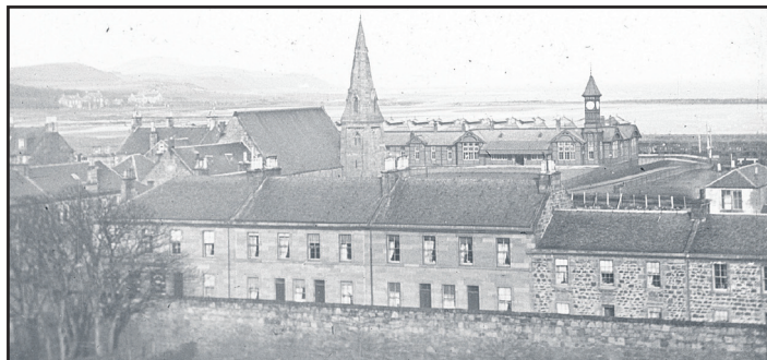
Unidentified coastal town or village, with church spire, terraced housing and possibly a train station in the background. sc3615.

HIDDEN trove of photographs taken over a century ago are believed to have been taken by a Donaghmore industrialist.