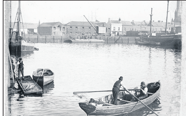
View of Belfast Harbour with two men rowing in foreground and the Rotterdam Bar and church spire in the background. Images from the Killaloe Lantern Slide Collection in the RCB Library Dublin are reproduced here courtesy of the Representative Church Body. sc3616.

But it is a very convincing lead. How many Irishmen were through Palestine at that time?